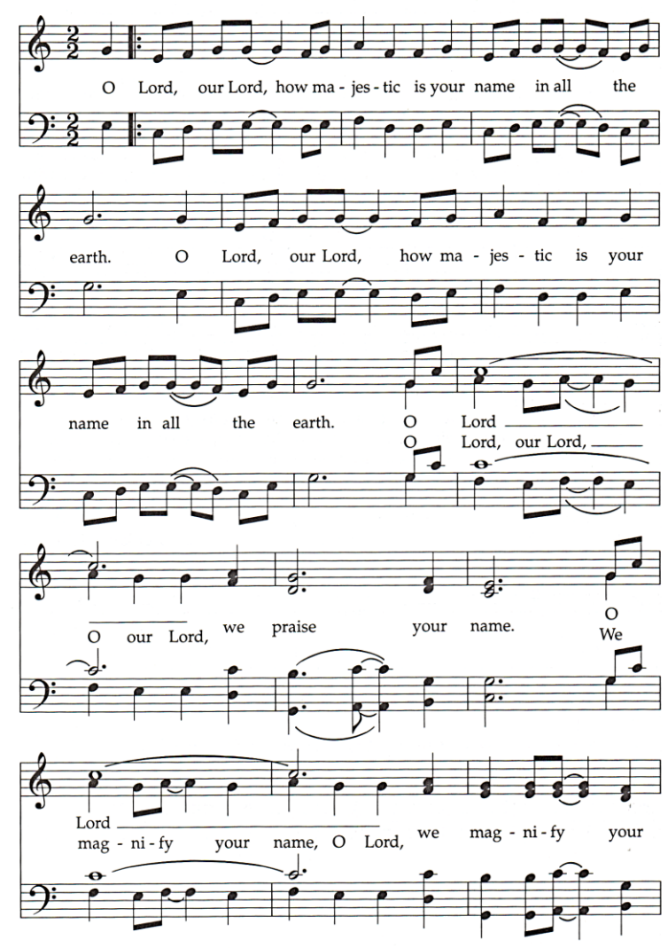
Text: based on Psalm 8, Michael W. Smith