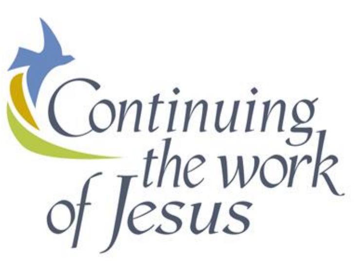
Peacefully. Simply. Together.

Hospitality is an important part of our life together we want to know your name! If you're new here, we'd be glad to make a nametag for you. If you've been here a while, we'd love to provide a permanent nametag.