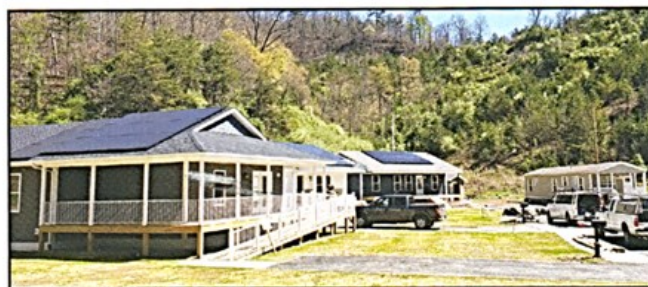
Solar panels can be seen on the roofs of several Thompson Branch (Letcher County, Ky.) homes on which BDM volunteers worked.

Find out more about the work that HOMES is doing in the community, in addition to the work BDM is supporting, at their website www.homesincorporated.org .