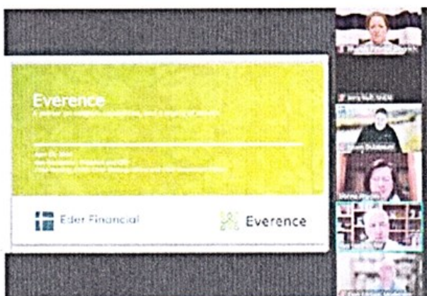
Everence leaders presented information about their organization during the special meeting of Standing Committee.

Most Eder employees are expected to be let go by the end of 2026. They are receiving severance packages and professional help with job placement.