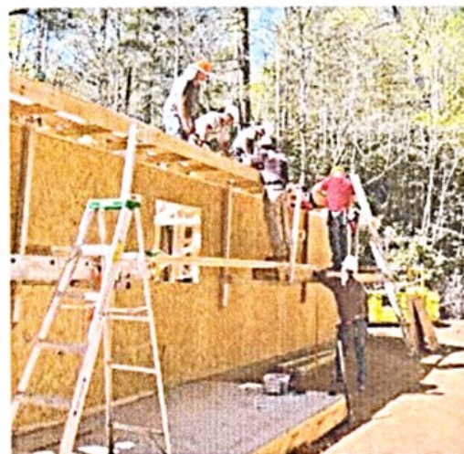
A new home being built by Brethren Disaster Ministries volunteers in Henderson County, N.C., for a Hurricane Helene survivor.

Additional Hurricane Helene recovery sites in North Carolina may include a 10-week site in Yancey County beginning June 7.